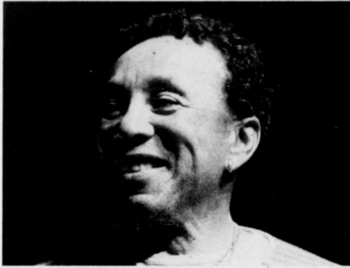
Singer Smokey Robinson speaks to students Friday at the Duke Ellington School of the Arts in Washington, D.C.

Robinson said he started singing the day he was born "according to