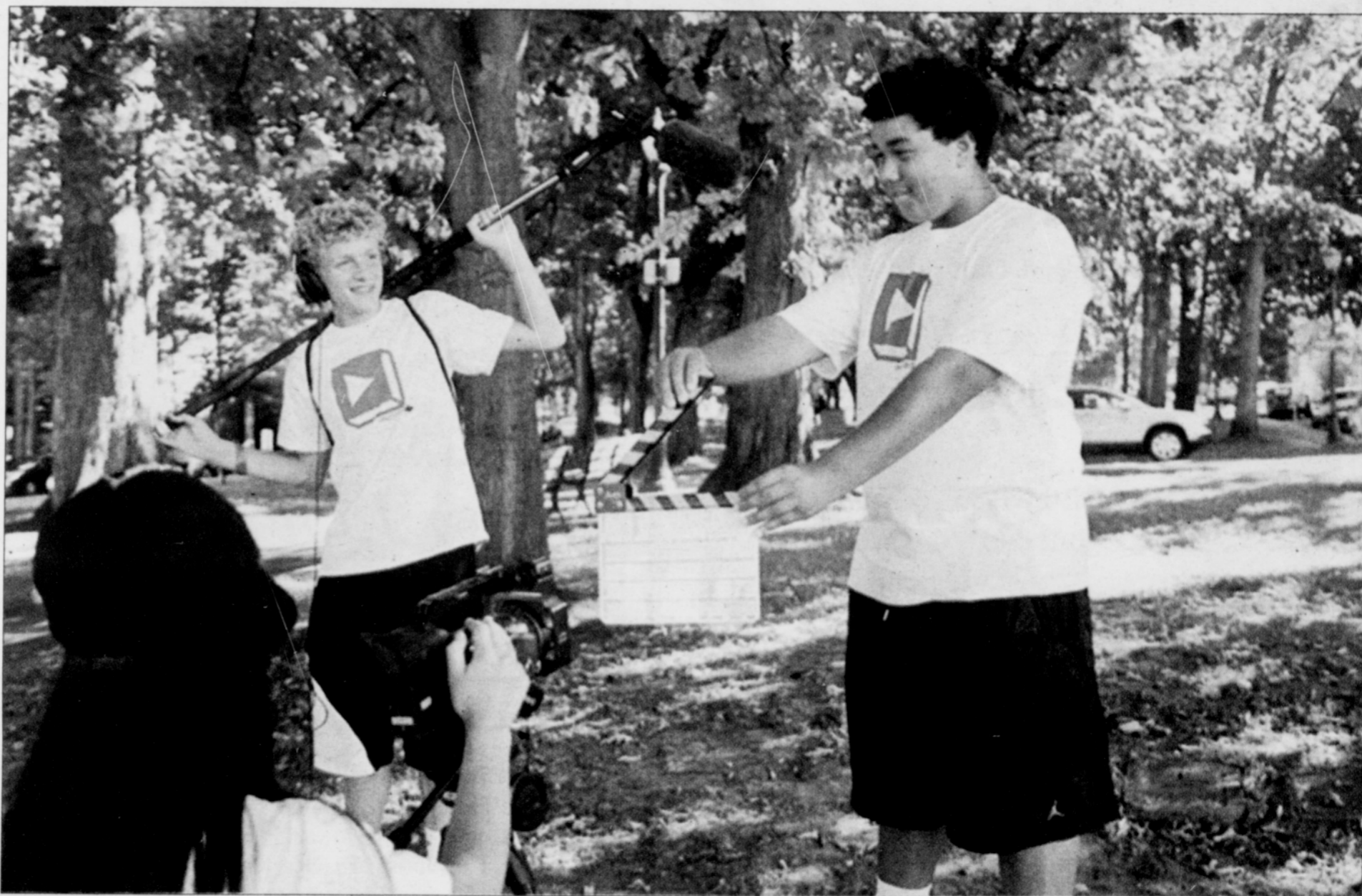
The Northwest Film Center School of Film sponsors film camps for kids and teens, connecting youth to moviemaking, technology and media literacy.

The Film Camp has offerings for kids and teens grades 2-12. High school students are invited to participate in the Media Arts Academy for Teens, a week