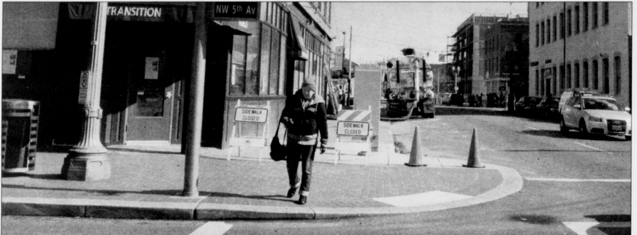
Construction is bringing some new housing to the Portland market, but the city still lacks a sufficient inventory of affordable housing where costs don't push residents into spending more than half their household income on rent.

But the need is still great. "We don't have enough resources to