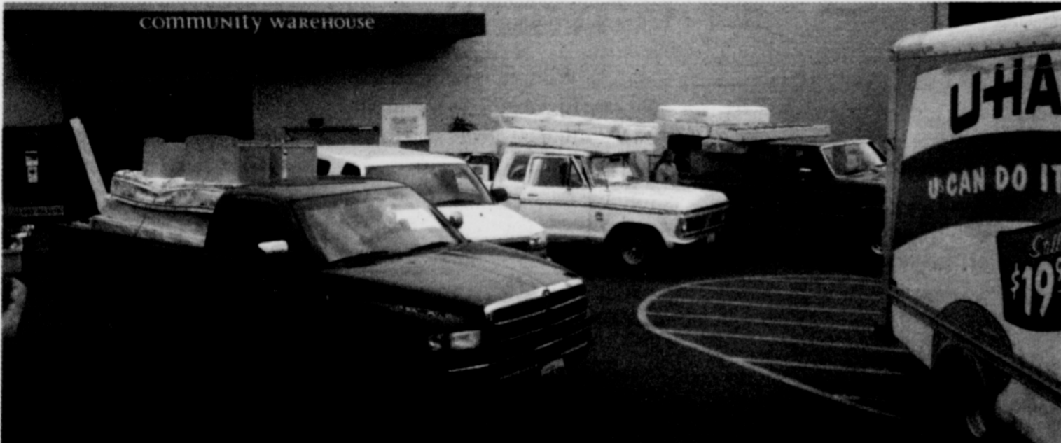
Families and individuals in need come to the Community Warehouse, 3969 N.E. Martin Luther King Jr. Blvd., for essential household goods and furniture.