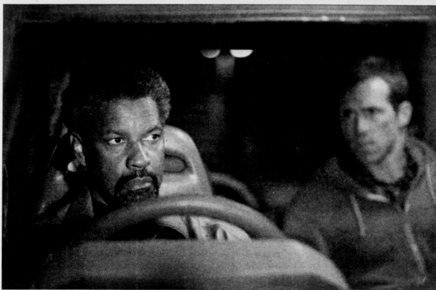
Is it 'Safe'? Denzel Washington dips into the sociopath mindset to play a CIA agent turned killer in "Safe House," now playing in Portland area theaters.