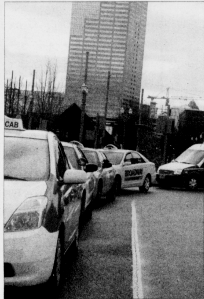
Taxi cab drivers line up for passengers at Union Station, downtown.