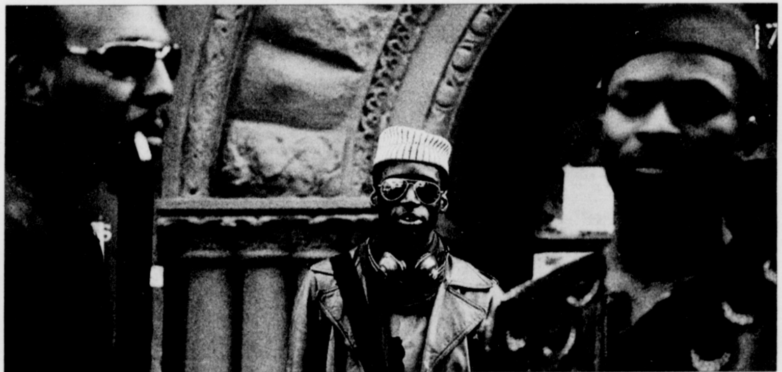
A scene from 'Restless City,' a film is set in the volatile world of West African immigrants in New York City.