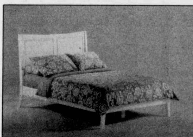
Saffron Bed in Twin or Full $200 or $250