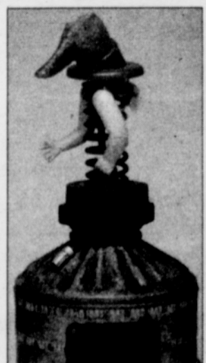
A mixed media sculptural assemblage by Chris Giffin.