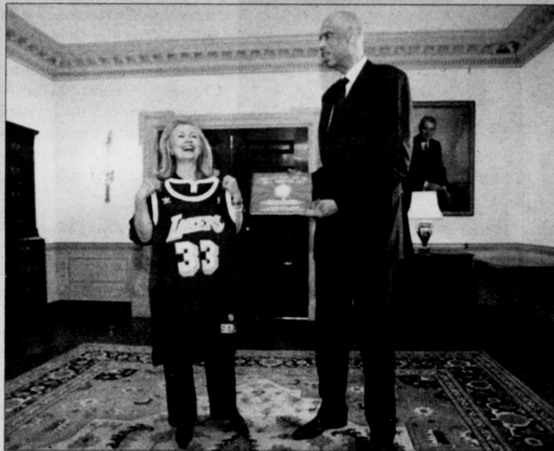
Secretary of State Hillary Rodham Clinton laughs after receiving a Los Angeles Lakers basketball jersey last week as a gift from former NBA basketball star Kareem Abdul-Jabbar at the State Department in Washington, D.C. Abdul-Jabbar will travel the world to engage a generation of young people to help promote diplomacy.

The legendary center scored 38,387 points during his 20-year NBA career.