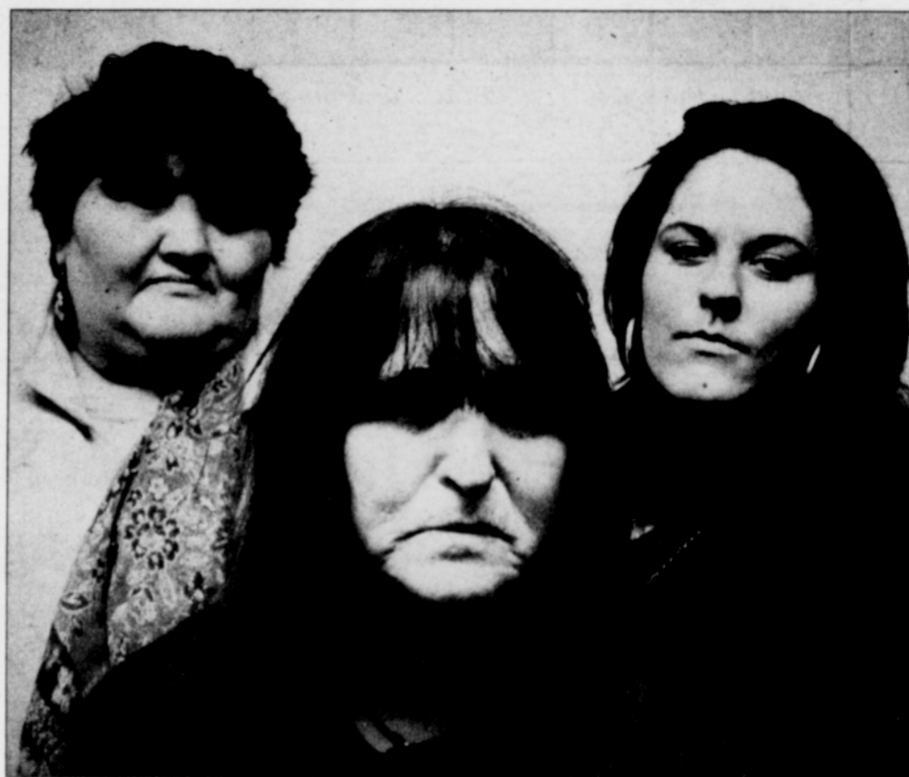
Survivors of human trafficking and the sex trade will bring awareness to the issue and a call to action during staged readings this weekend at the Sellwood Masonic Temple as part of Portland's Fertile Ground Festival.