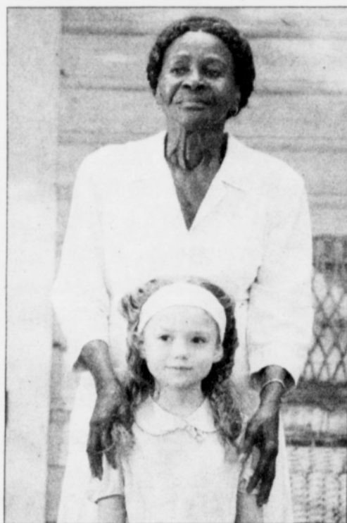
As scene from the movie 'The Help.'

Beyonce and Jill Scott both received four nominations in the music categories. They'll vie against Jennifer Hudson, Ledisi and Mary J. Blige for the outstanding female artist trophy.