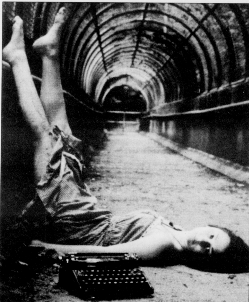
'Without Words,' digital photography by Salem Carrico Rogers.

at 6 p.m. for a juried visual arts exhibit and performances beginning at 7 p.m.