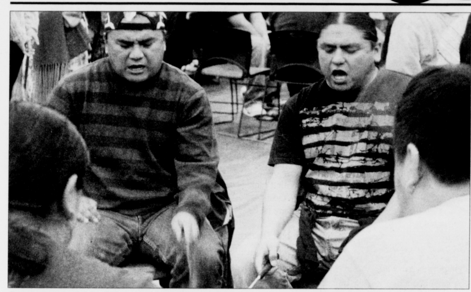
Drummers perform at last year's powwow at Portland Community College's Sylvania Campus in southwest Portland. The annual event returns Saturday, Jan. 21.