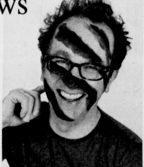
Portland comedian auGi presents 'Big Plastic Heroes.'

For advance tickets, visit who will tell their own 10-minute bigplasticheroes.com or call 804-353-3799.