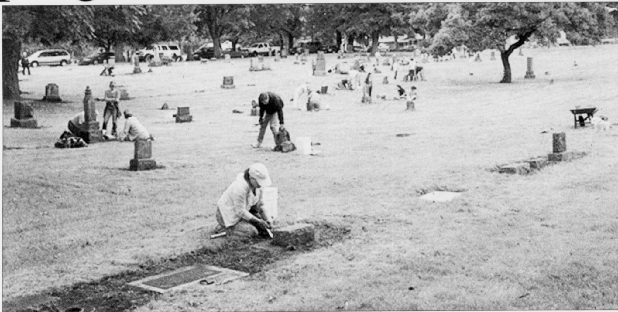
Volunteers help restore Old Vancouver Cemetery on the Martin Luther King Jr. Day of Service.

Volunteers are also needed from 9 a.m. to 1 p.m. to remove blackberry vines and mulch around pear trees in the old orchard on Northwest 21st Av-