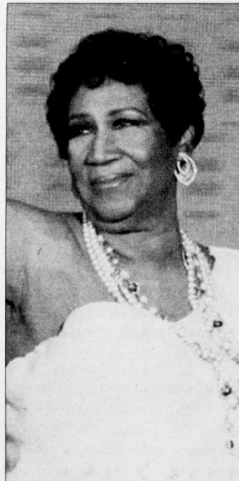
Singer Aretha Franklin during an appearance last year on the Oprah! show.

She's also scouting locations for the ceremony, which she estimates will include about 250 people. While