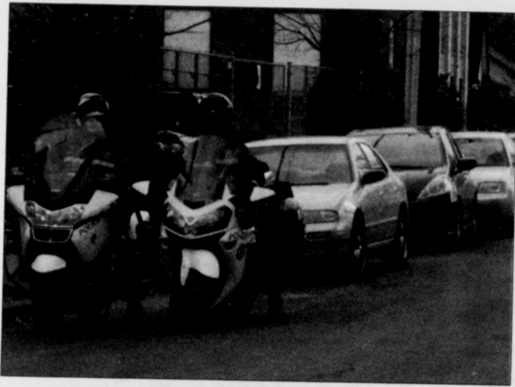
Two Portland Police Officers on motorcycles are part of a cross-walk enforcement event held last Wednesday at North Commercial and Killingsworth Street.