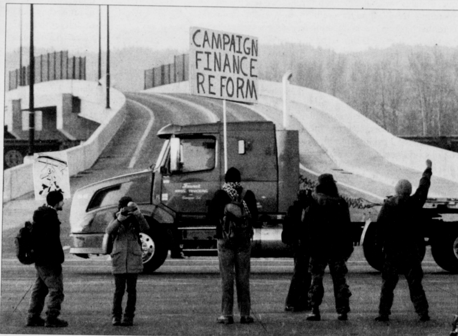
Protesters set up a picket line at a Port of Portland terminal Monday as part of a West Coast "day of action." Anti-Wall Street protesters along the West Coast joined an effort to blockade some of the nation's busiest shipping cargo docks.