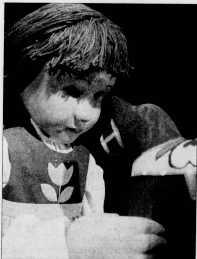
Tears of Joy Puppet Theatre presents "Ride the Red Mare" based on the book "A Ride on the Red Mare's Back" by Ursula K. Le Guin.

Performances continue through Dec. 31 at the World Trade Center Theater, 121 S.W. Salmon St. For tickets and more information, call 502-205-0715 or visit portlandplayhouse.org .