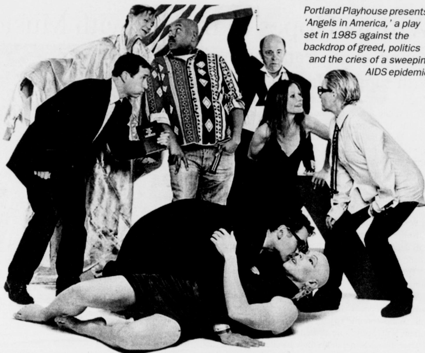
Portland Playhouse presents 'Angels in America,' a play set in 1985 against the backdrop of greed, politics and the cries of a sweeping AIDS epidemic.