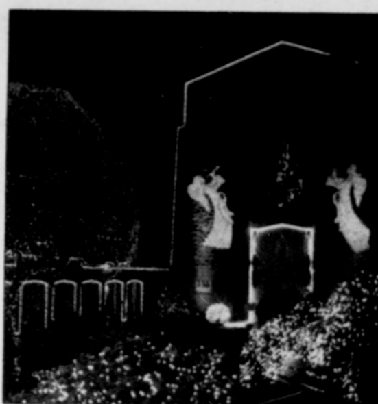
See Metro, page 9

Heaven and earth sing with nightly concerts