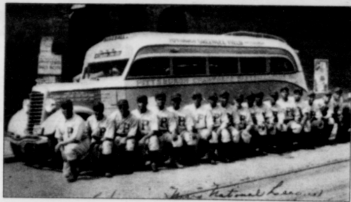
See Metro, page 9

Exhibit tells story of African-American baseball