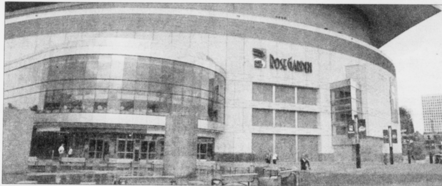
The Rose Garden Arena will once again come to life for Portland Trail Blazers games. A tentative labor agreement between NBA owners and players has the league beginning a 66-game season on Dec. 25.

league will play a 66-game season beginning Dec. 25. Training camps and free agency would open on Dec. 9.