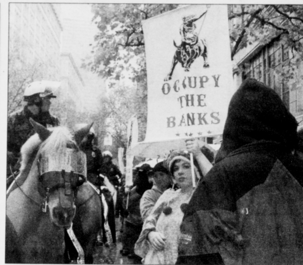
Hundreds of police officers lined the streets on Thursday as Occupy Portland demonstrators congregated downtown to protest big banks, their banking practices, home foreclosures and other economic injustices.