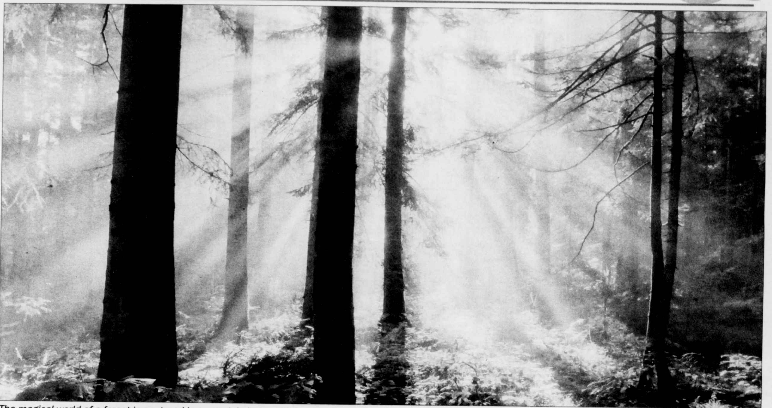
The magical world of a forest is captured in a special photo exhibit at the World Forestry Center Discovery Museum.