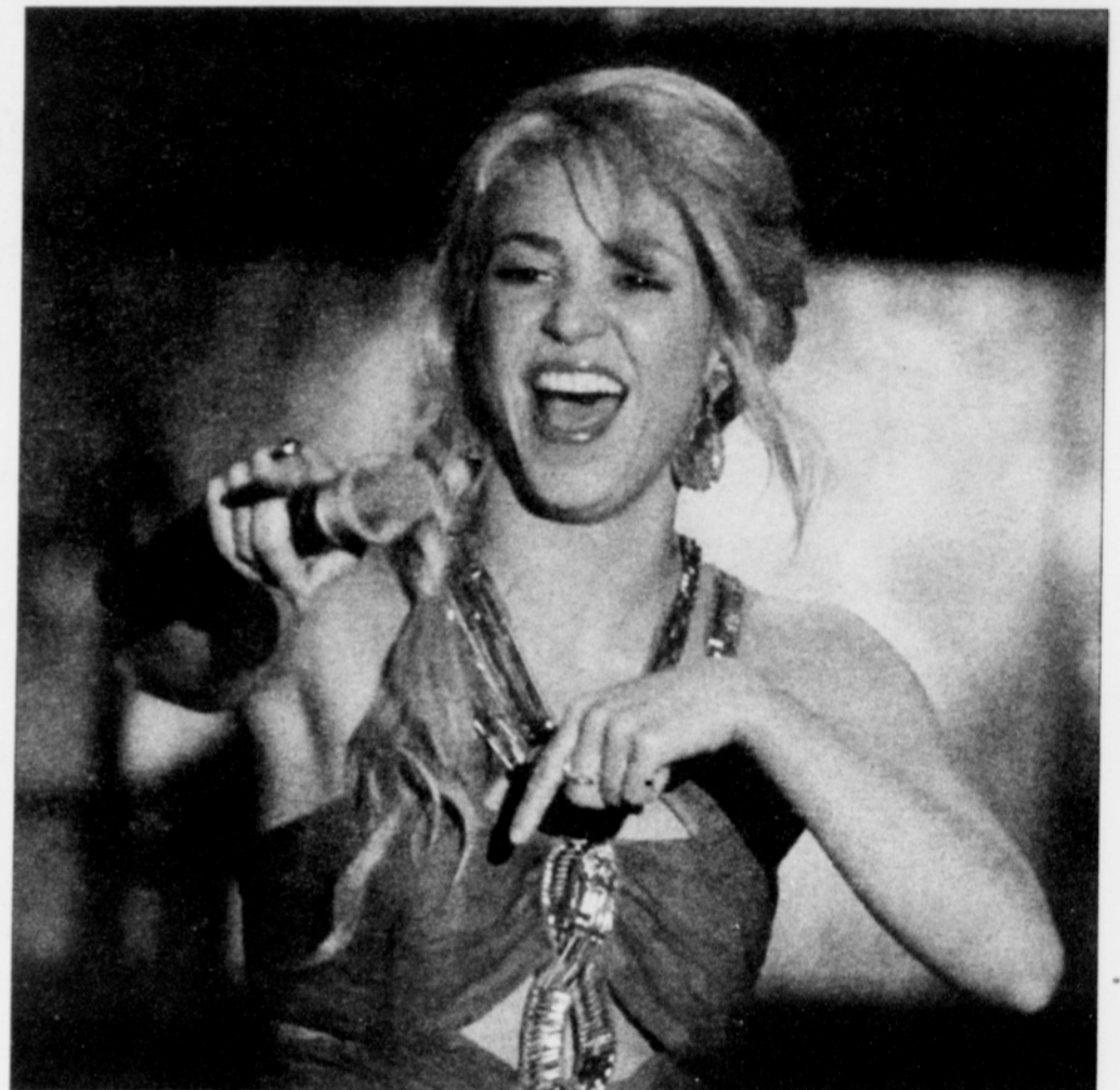
Shakira performs in Las Vegas Nov. 9 at the Latin Recording Academy Person of the Year tribute in her honor.