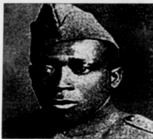
Henry Lincoln Johnson

According to federal regulations, the Medal of Honor is awarded by