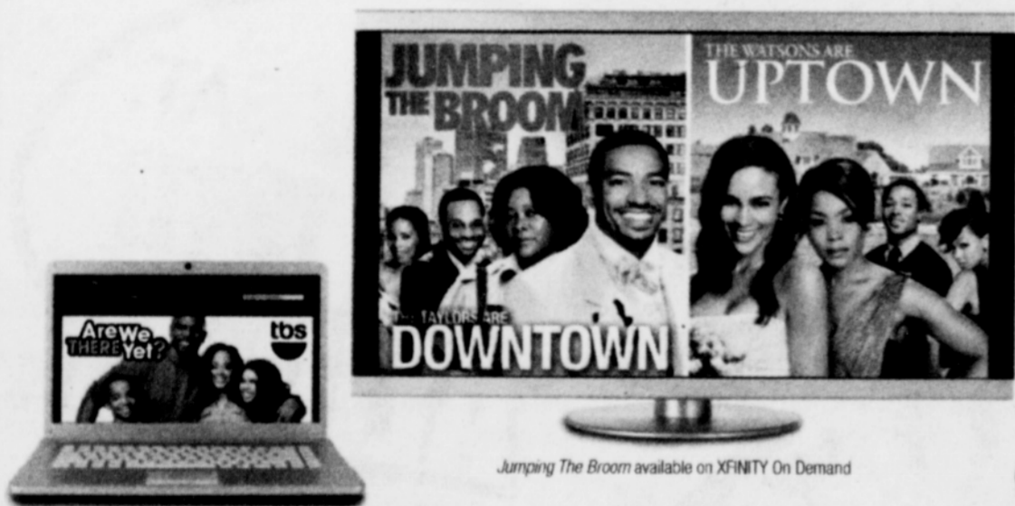
Are We There Yet? available at xfinityTV.com

Switch to the XFINITY® TRIPLE PLAY. No term contract. No early termination fee.