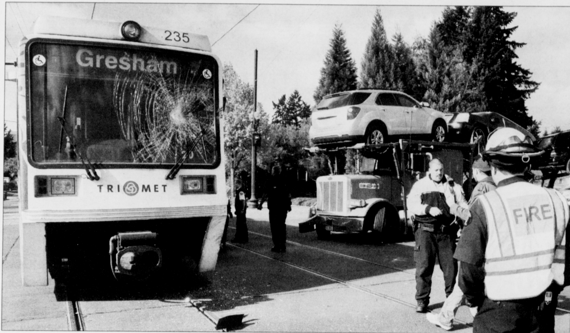
A Blue Line train bound for Gresham collided with a semi tractor-trailer in Hillsboro Monday. Eight people were injured.

Five of the passengers and the semi driver were transported to area hospitals with various injuries, according to Hillsboro firefighters and medics who responded to the scene. A seventh Max passenger was transported by privately-owned vehicle to a hospital.