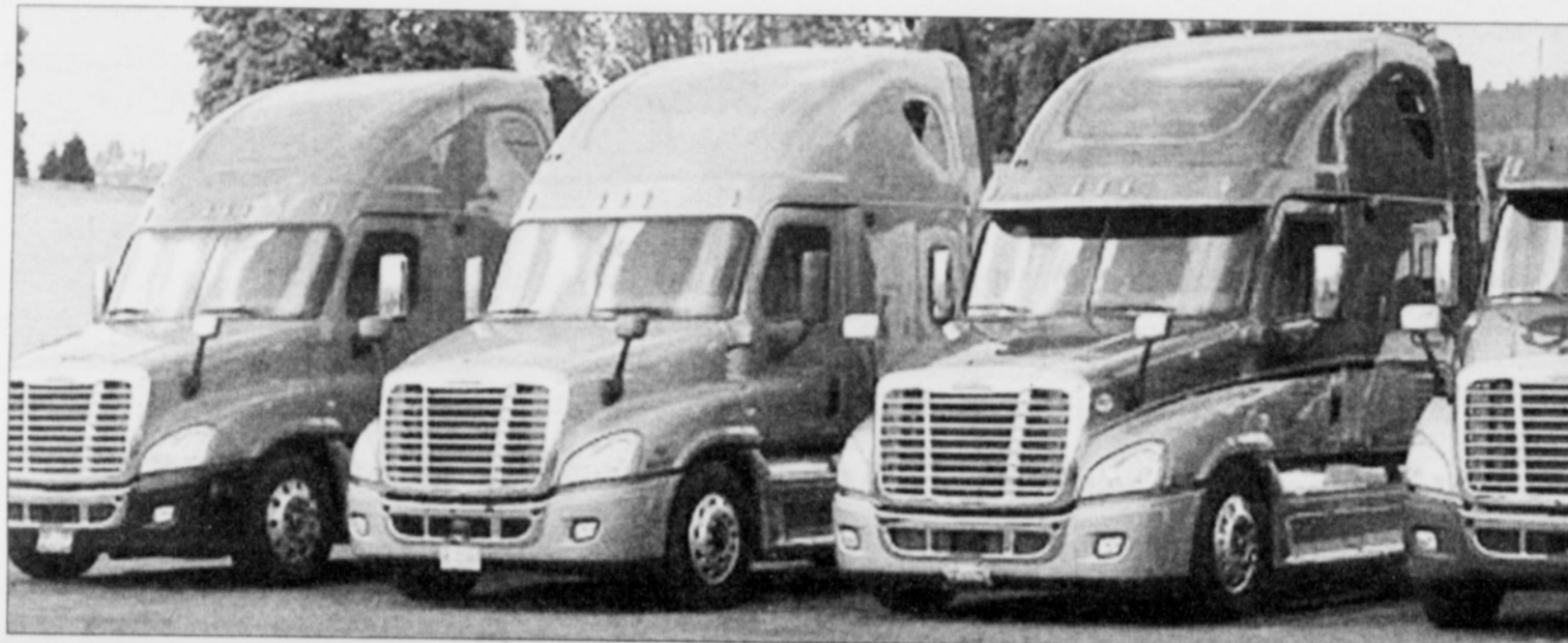
Daimler Trucks will add a second shift and 350 new jobs to its Swan Island manufacturing plant.

Daimler Trucks has announced the addition of a second shift and plans to ramp up production at its Portland Truck Manufacturing Plant on Swan Island in north Portland, creating about 350 new jobs at the facility by the end of 2012.