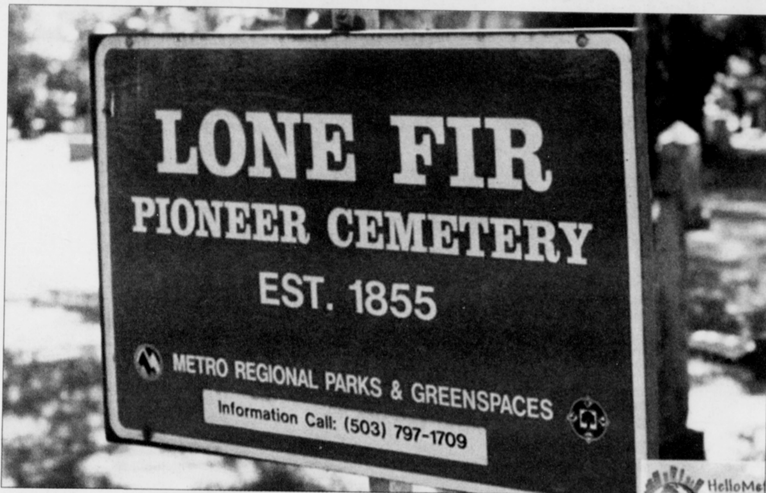
Lone Fir Cemetery celebrates Halloween with its annual "Tour of Untimely Departures."

Just in time for the spooky season, you can join The Friends of Lone Fir Cemetery for the one night when some of the cemetery residents come to life. The Tour of Untimely Departures, held Monday, Oct. 31, offers a glimpse of the lives and deaths of the long-deceased inhabitants of the southeast Portland landmark.