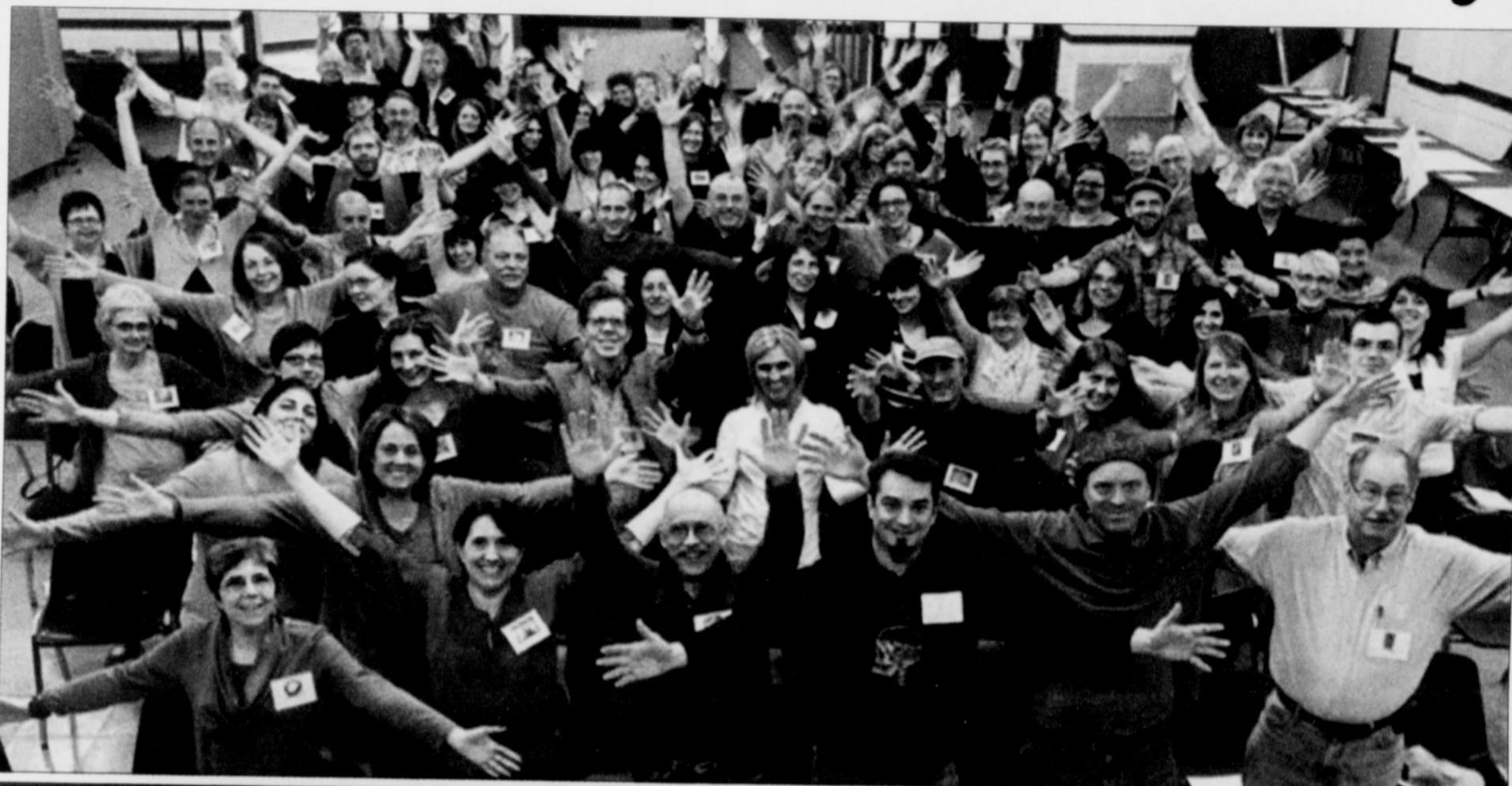
(Above) Giving a shout out to this year's Portland Open Studios tour are many of the 100 artists who will open their studios to the public.

For more information visit the website at portlandopenstudios.com .