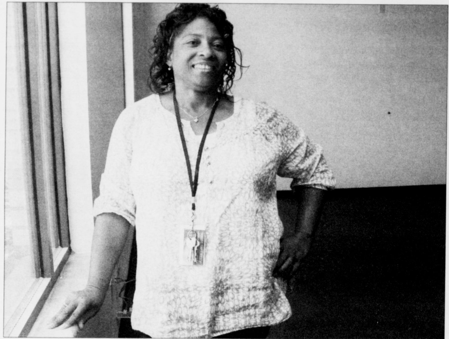
The Contractor Lady graduated from PCC's construction trade program 20 years ago and is now owns her own construction agency. Her firm, the Boanerges Group, recently finished work on a remodeling project at the Cascade Campus.

"We're trying to build our capacity as a company so that we're more in control of the work so we can