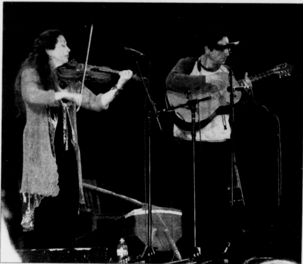
Correo Aereo brings string and percussive instruments to the stage.