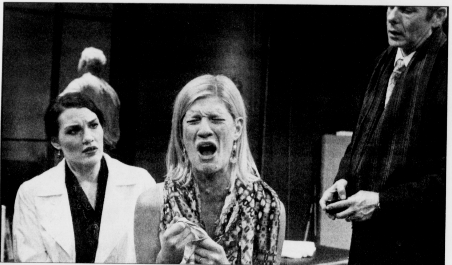
Parents battle for ethical superiority in the Artists Rep production God of Carnage , a Tony award-winning comedy.