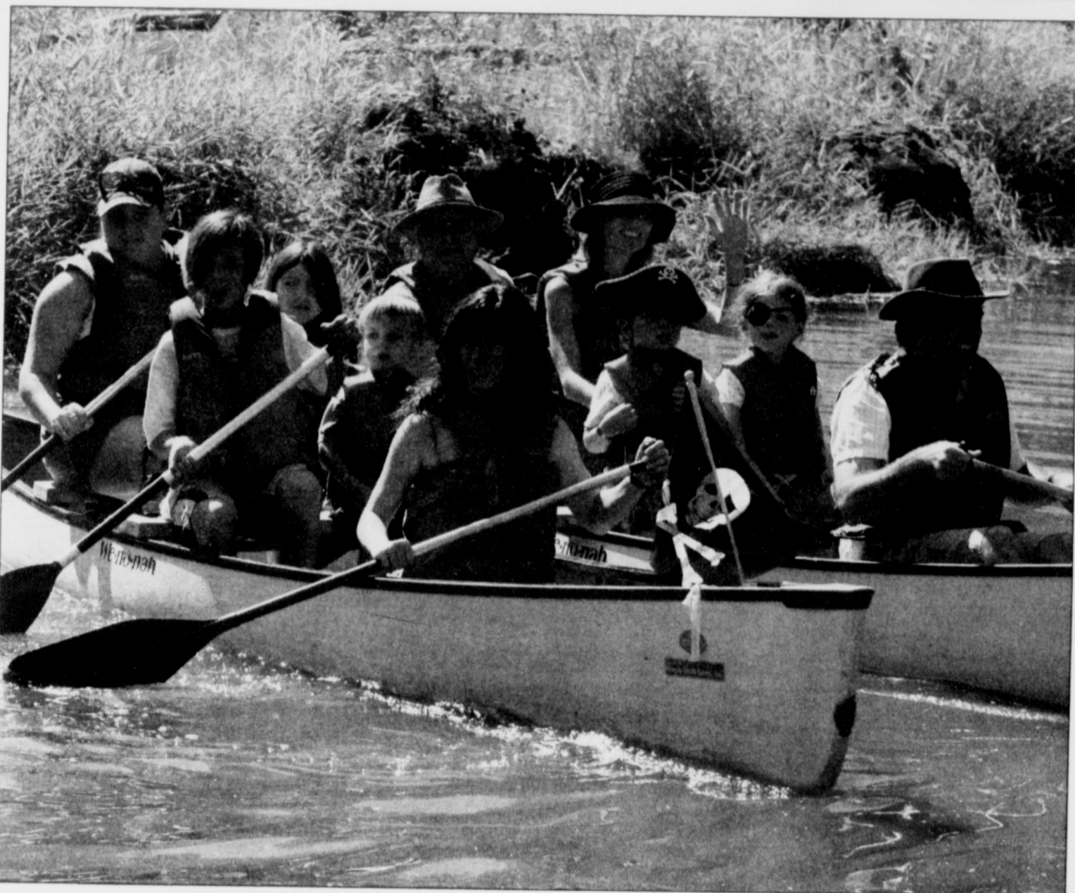
A canoe ride is part of the fun at the Aquifer Adventure, a pirate themed family festival. The annual event returns Saturday, Sept 17, to the Columbia Slough Trailhead on Northeast 166th Avenue and Airport Way.