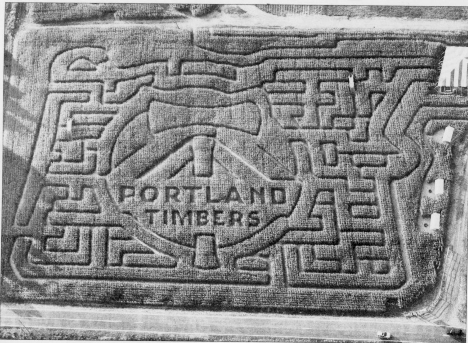
The Portland Timber's logo is carved into the towering corn field maze on Sauvie Island.

The human puzzle is created inside a 5-acre corn field on the farm, located at 16511 N.W. Gillihan Rd.,