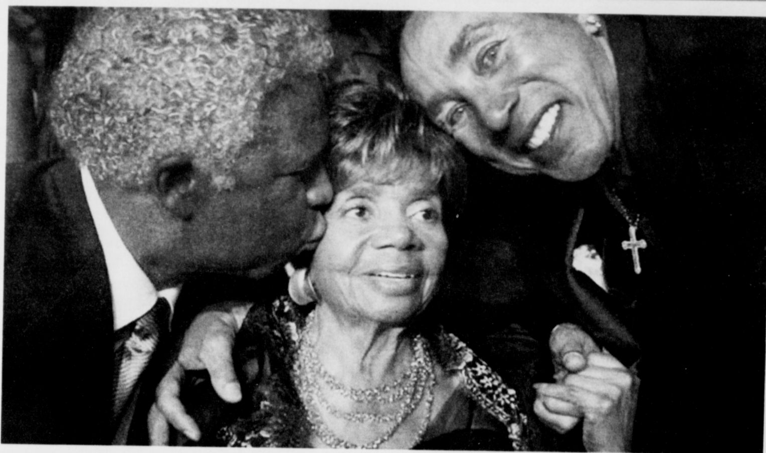
William "Mickey" Stevenson, Esther Gordy Edwards and Smokey Robinson are pictured in 2005.