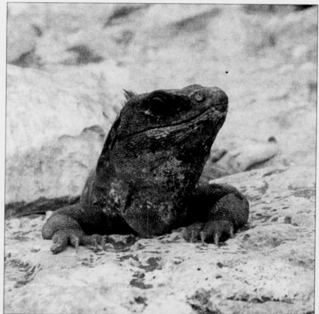
The Reptile and Amphibian show returns to OMSI Labor Day weekend, Sept. 3-5.

In addition to the many animals on view in the OMSI auditorium, there will be a hands-on area where visitors can touch non-venomous species. Several presentations will be shown throughout the weekend including the popular pancake tortoise drawing, Mr. Lizard's Mobile Zoo, and experts on venomous snakes.