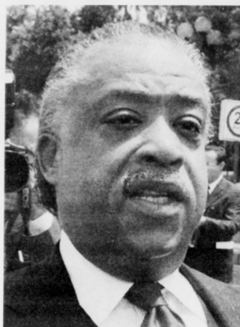
Rev. Al Sharpton

Besides his work as a community leader and religious figure, Sharpton already hosts a nationally syndicated radio show. He