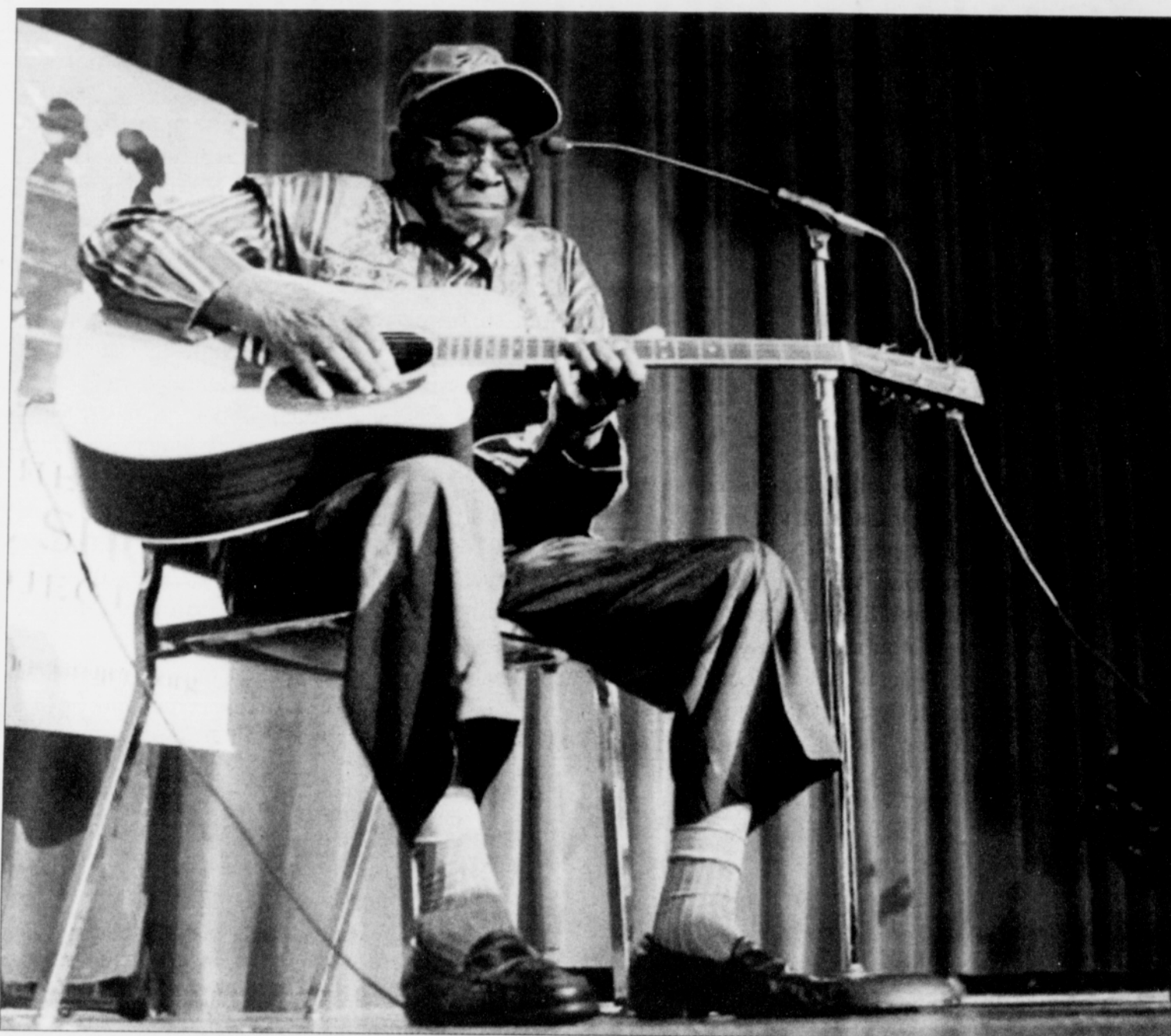
Blues singer David "Honeyboy" Edwards, 92, performs at North Dallas High School in Dallas, Texas in 2007.

"We carry your heart in our hands, with compassion and care"