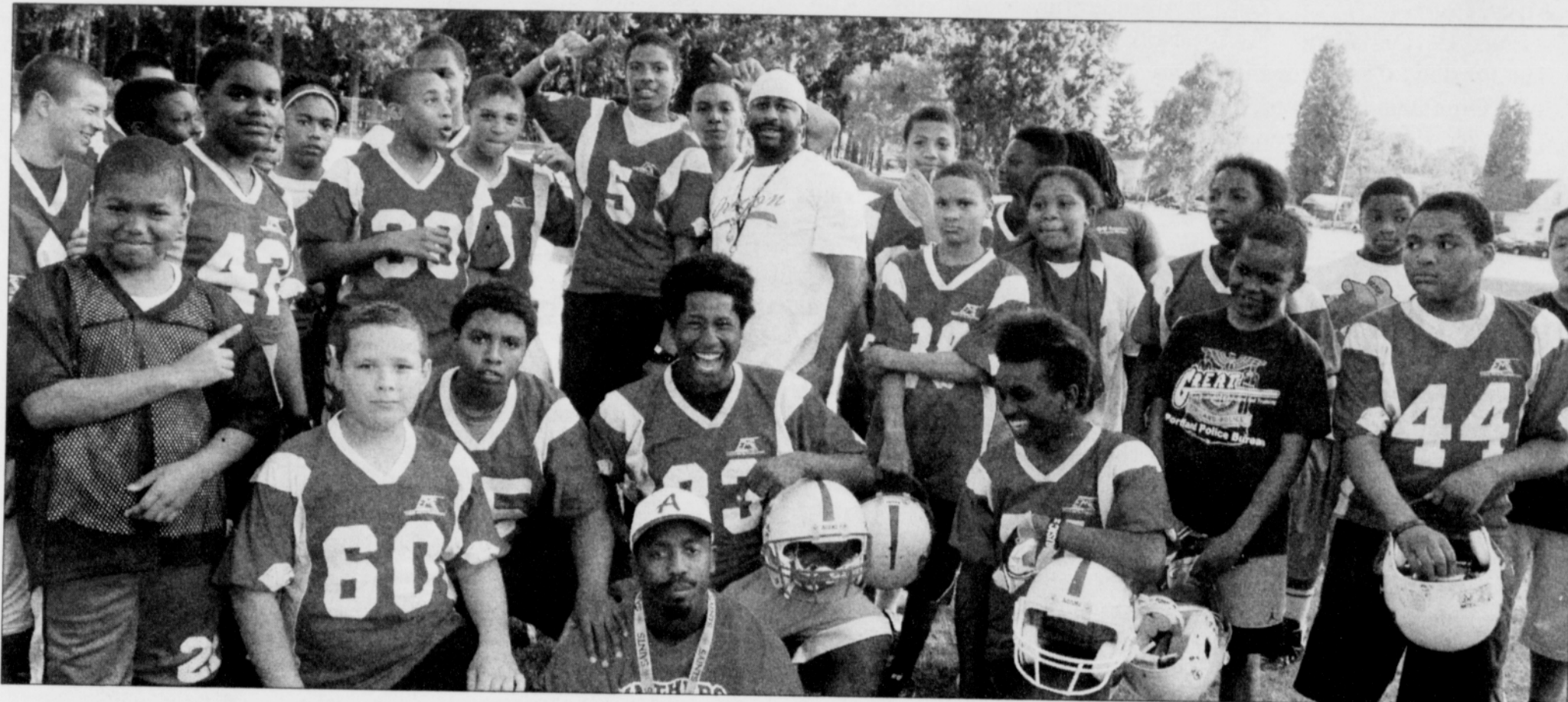
Young football players gather at Alberta Park in northeast Portland as part of the Police Activities League program. The youth have held a number of public service events to give back to the community.