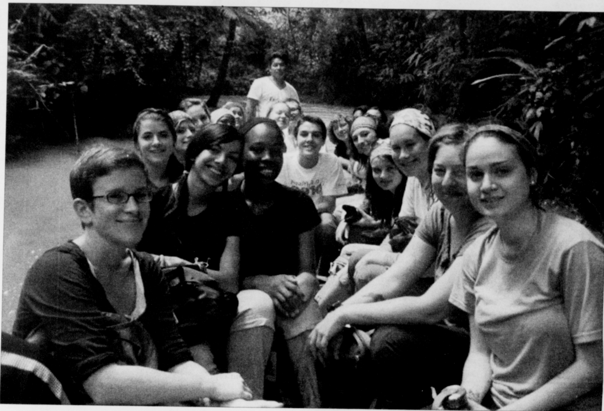
Fifteen ZooTeens and three of the youth in the Zoo Animal Presenters internship program traveled to Peru in June to see rainforest conservation in action.

Teens that join the program as rising freshmen now have the opportunity to participate in ZooTeens for up to five summers, sometimes accruing more than 2,000 hours of service. Teens with a few summers under their belts can also participate in the Zoo Leadership Corps, a winter program that includes keeper job-shadows, internships and work with some of the zoo's more exotic animals.