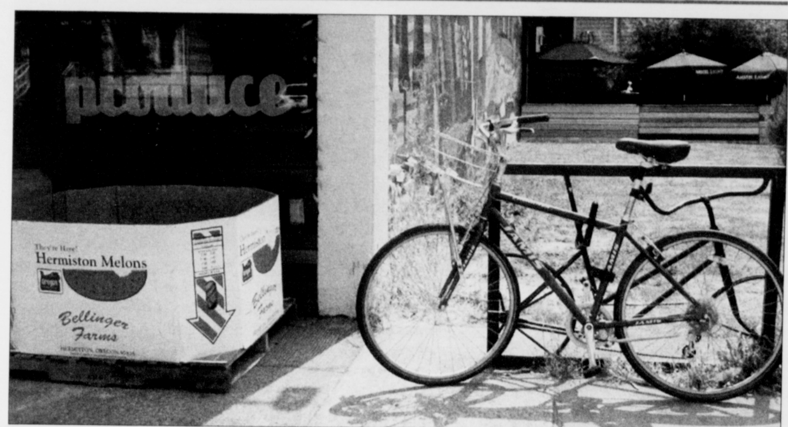
Cherry Sprout Produce, 722 N. Sumner St., will supply the canvas and paint for the community Art in the Park celebration, on Saturday, Aug. 20, at the park space next door to the market.