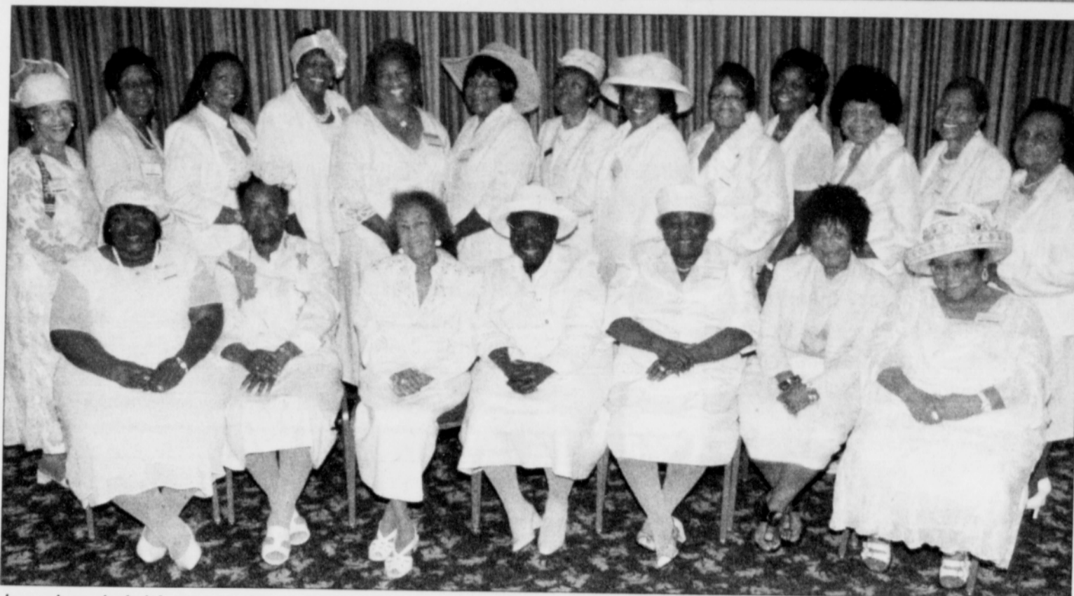
Local and visiting members of the National Association of Colored Women's Clubs and Youth Affiliates, Inc., gather in Portland for the 35th biennial conference of the club's Northwest Region at the Ramada Inn near the airport.