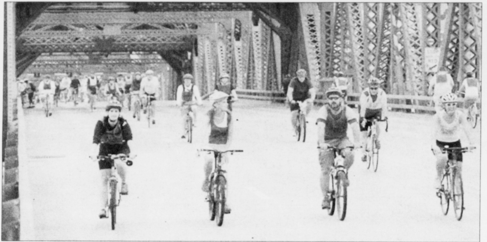
The Broadway Bridge across the Willamette River, downtown, becomes a crossing just for bicycles and foot traffic for the annual Providence Bridge Pedal returning for its 16th year on Sunday, Aug. 16.