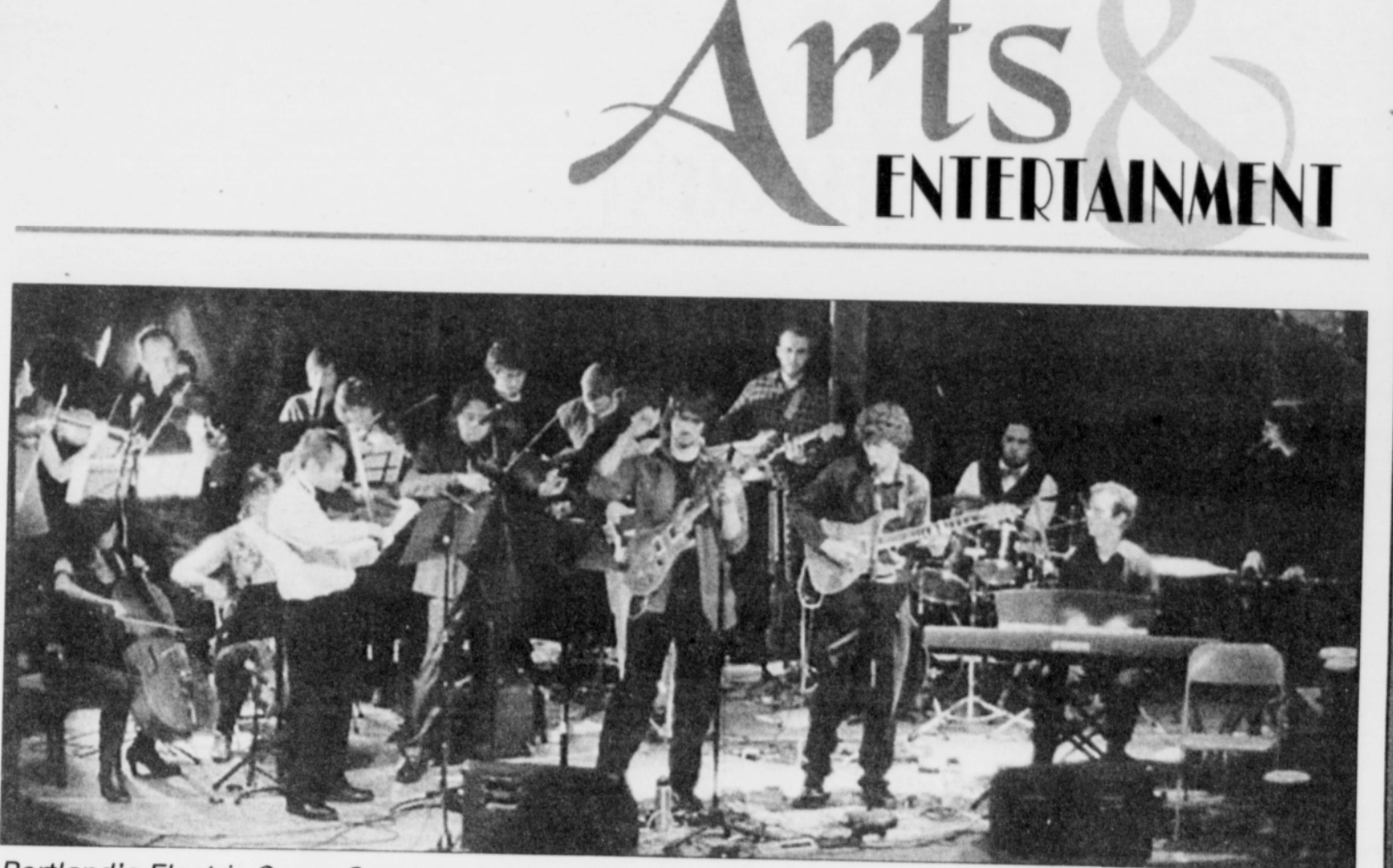
Portland's Electric Opera Company brings alternative classical music to the stage.