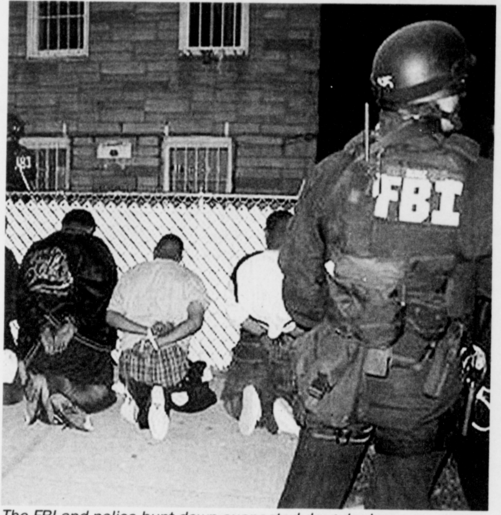
The FBI and police hunt down suspected drug dealers.

"Studies show that all racial groups abuse drugs at similar rates, but the numbers also show that African Americans, Hispan-NAACP president and chief execu- ics and other people of color are stopped, searched, arrested, charged, convicted, and sent to prison for drug-related charges at a much higher rate," said Alice with evidenced-based practices that Huffman, president of the Califor-NAACP. "This dual system of The resolution outlines the facts drug law enforcement that serves about the failed drug war, highlight- to keep African-Americans and ing that the U.S. spends over $40 other minorities under lock and billion annually on the war on drugs, key and in prison must be exposed