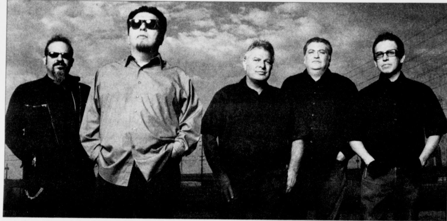
Los Lobos will take the Oregon Zoo stage with Los Lonely Boys Sunday, July 24 as part of the Oregon Zoo summer concert series.