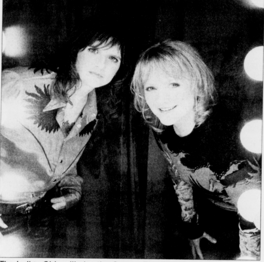
The Indigo Girls will play the Oregon Zoo Friday, July 22 as part of a must-see weekend of music.

Los Lobos' co-bill, Los Lonely Opening for the Indigo Girls is Boys, are a talented trio of brothers