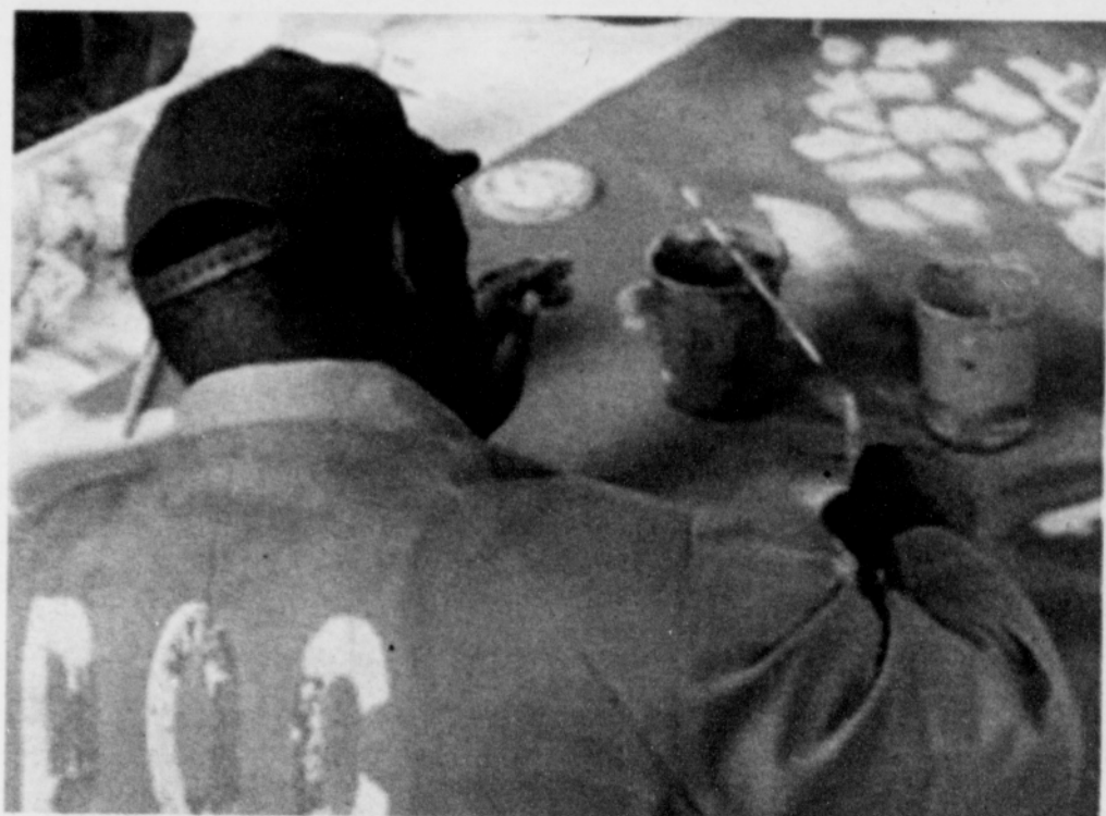
A scene from the documentary Concrete, Steel and Paint .