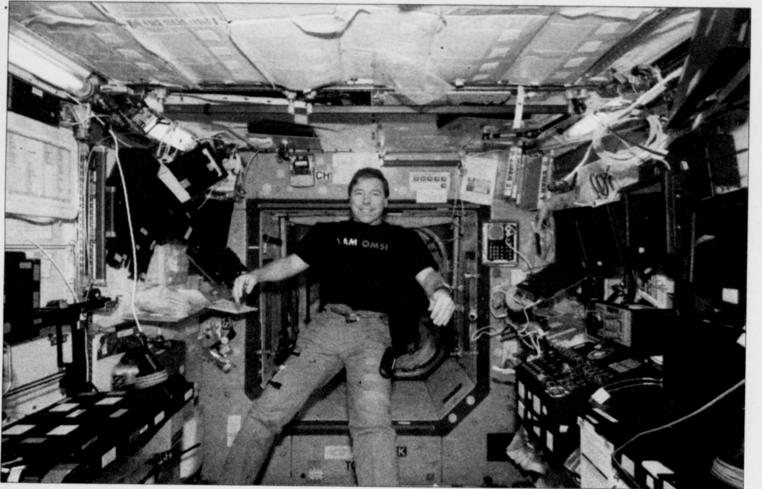
Former "OMSI Kid" Astronaut Mike Barratt dons an "I am OMSI" shirt on the International Space Station in 2009.