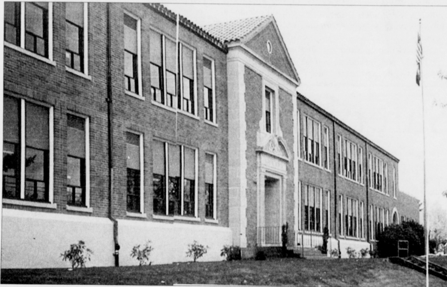
Vernon Elementary, 2044 N.E. Killingsworth St., will take in the entire seventh and eighth grade classes from Rigler Elementary this September, to ease overcrowding at Rigler.