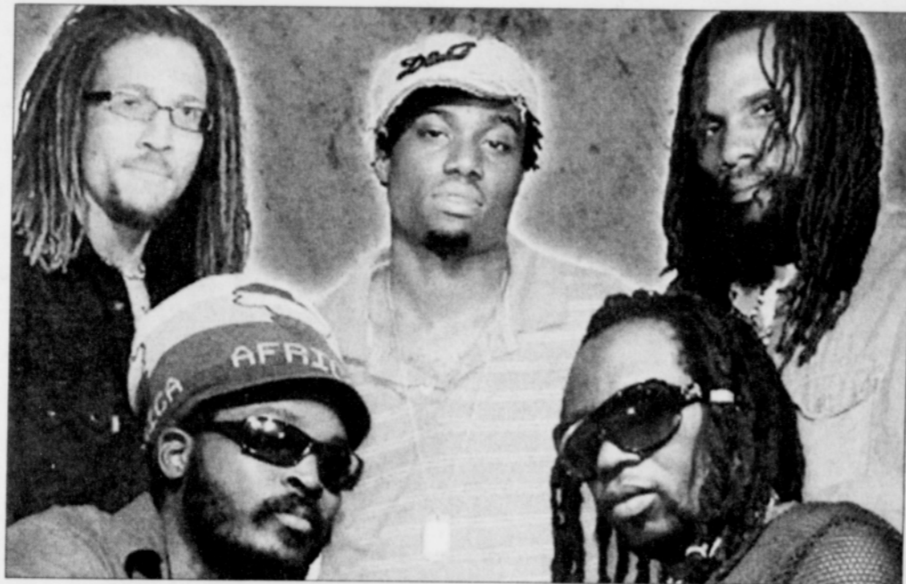
The Jamaican reggae group Dubtonic Kru performs Friday at Ted's, downtown.

Dubtonic's Kru also includes longtime friend and versatile gui-