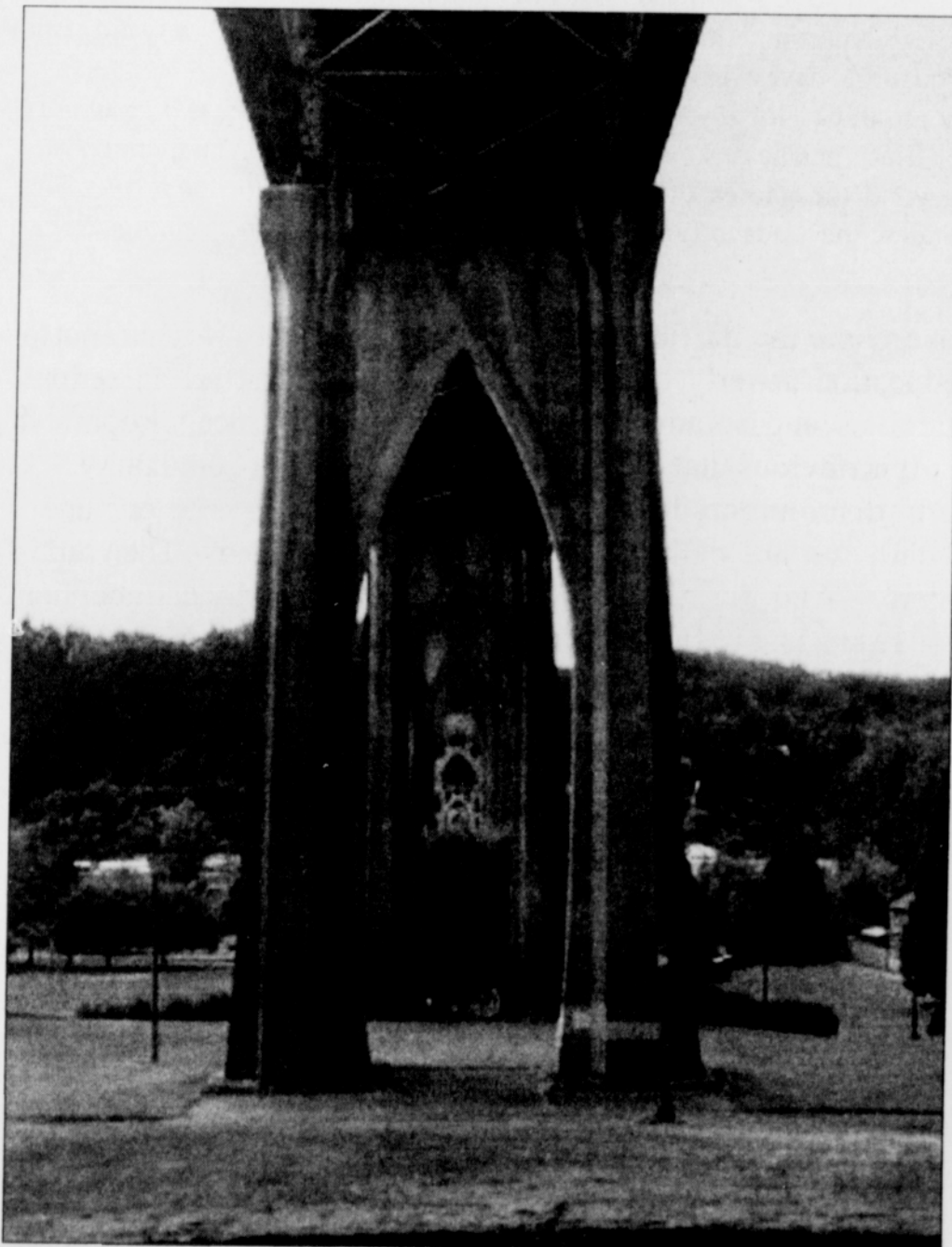
Cathedral Park under Saint John's Bridge